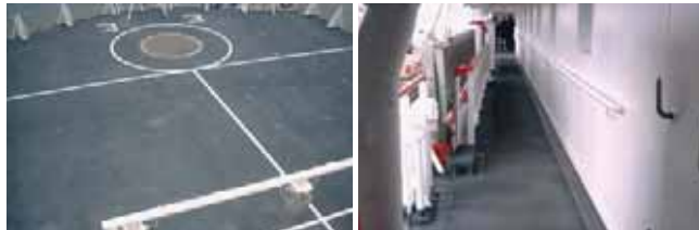
Flight deck – Completed with white markings