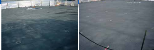
Flight deck – First full coat of Jota Armour