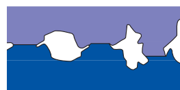
If the surfaces are smooth the contact points are modest and provide high slippage

The coefficient of friction (COF) is the value between the horizontal force (the person or item moving on the surface)