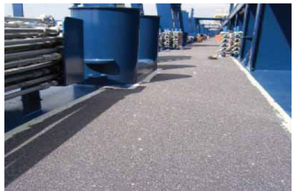
Jota Armour applied

Jota Armour is available in a limited range of colours, including Grey BS 640, and can be overcoated with a variety of topcoats.