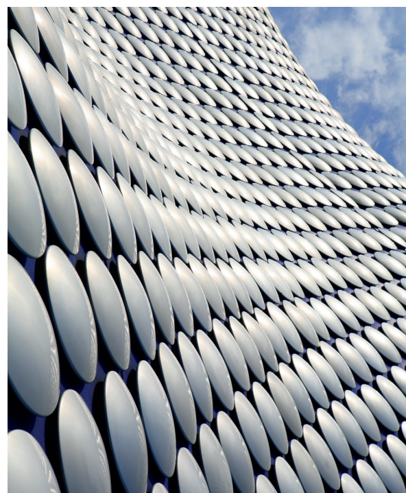
Selfridges, Birmingham, UK – protected by SteelMaster

Jotun's Green Building Solutions provide specifiers and building owners worldwide with approved systems ranging from decorative paints and architectural powder coatings to fireproofing and protective coatings that are independently tested and deemed as compliant to the most stringent green building certification standards, including LEED and BREEAM.